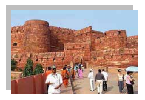
Overnight at the hotel.